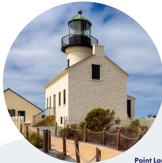
Point Loma Lighthouse