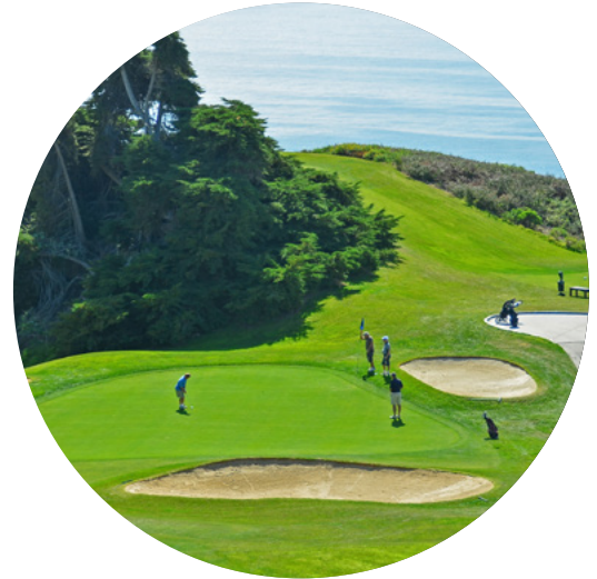
Torrey Pines Golf Course

Torrey Pines State Natural Reserve – torreypine.org