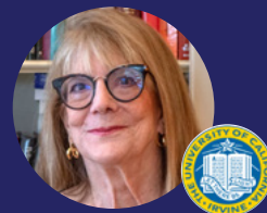
Elizabeth Loftus, M.A., Ph.D. Distinguished Professor of Criminology Law & Society University of California Irvine School of Law