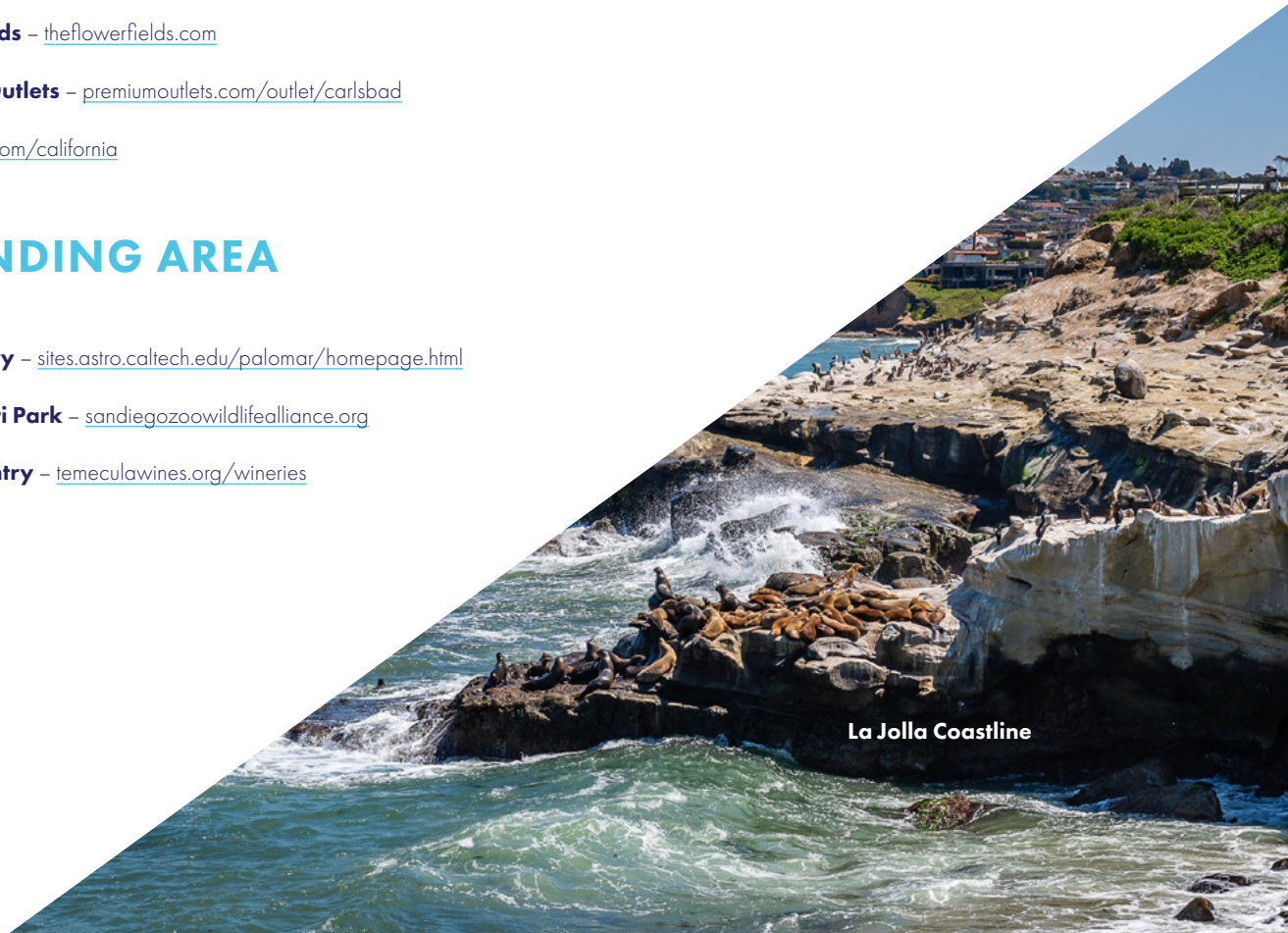
La Jolla Coastline

Temecula Wine Country – temeculawines.org/wineries